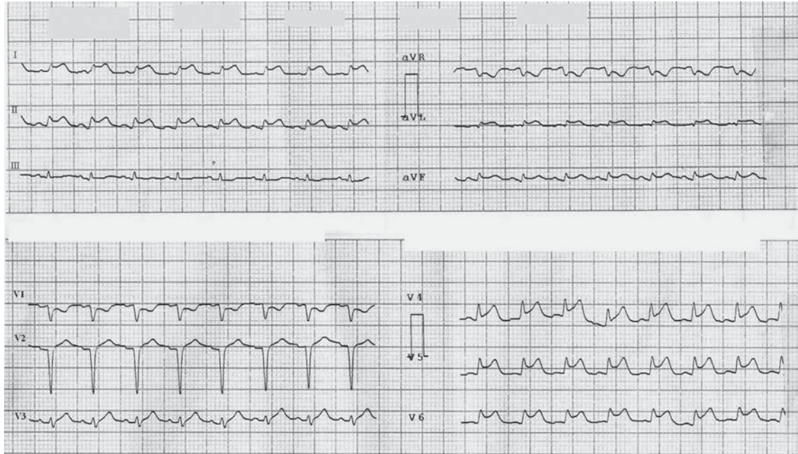
Figure 1. An electrocardiogram performed on admission to the Sari Heart Centre revealed diffuse ST-segment elevation and sinus tachycardia of 150 beats/min.

level was 4.13 ng/ml (normal range <0.4 ng/ml) and the lactate dehydrogenase level was 677 IU/l (normal adult range 0–250 IU/l). An electrocardiogram showed a sinus tachycardia with diffuse ST-segment elevation (Figure 1). Chest X-ray revealed an increased cardiothoracic ratio (cardiac enlargement) with bilateral clear lungs. An urgent bedside echocardiogram demonstrated severely compromised pump function (ejection fraction 15%), left ventricular enlargement, right ventricle and atrium diastolic collapse, and moderate to large pericardial effusion (Figure 2). A bedside abdominal ultrasonographic examination revealed a small amount of fluid in the Morison pouch and mild right side pleural effusion.